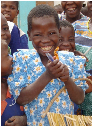
GFG has provided school supplies to over 15,000 students in Malawi. Photo: Brigitte Zimmerman, 2008

Goods for Good is 2 years old! It's hard to believe, but in April, Goods for Good (GFG) will celebrate its second anniversary.