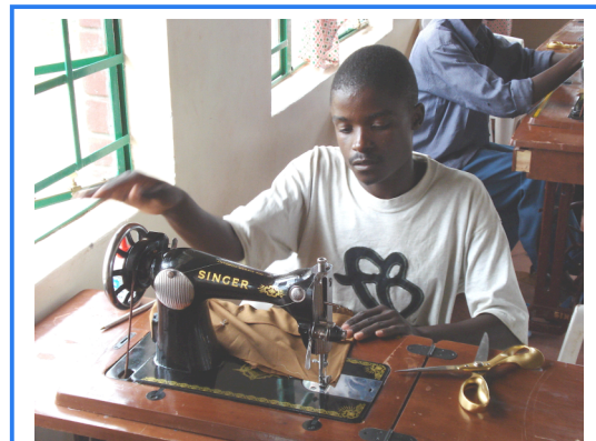
Fabric provided by Goods for Good is used in Consol Homes' vocational training program.

In response, GFG has developed the Teaching and Learning Tools for Schools program to support children and their teachers. In partnership with Africare and St. Mary's Rehabilitation Centre, GFG has distributed pens to over 15,000 students at 22 rural public schools. The program is already having a positive effect: one school reported that, after the pens were given out, attendance across the school increased and teacher morale greatly improved.