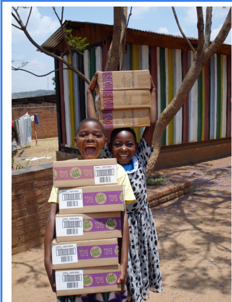
St. Mathias Primary School students receiving donated school supplies from Goods for Good.

Malawi is one of the poorest countries in the world. Famine, inadequate healthcare and high rates of HIV/AIDS have contributed to the rapidly growing orphan population, estimated at approximately 1.5 million. There are few resources for these children and they struggle to obtain basic necessities such as food, clothing, shelter and education.